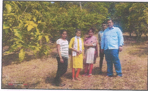
T.Y.B.Sc. Field Visit (Grassland Ecosystem)