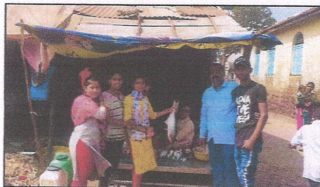
T.Y.B.Sc. Field Visit (Fish Market)